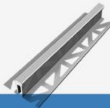
Stainless Steel Trim